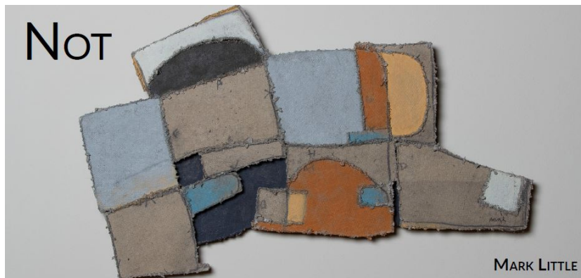
Not a Chance , oil, acrylic, and graphite on custom panel

On Exhibition at the Maine Jewish Museum January 9, 2020 to February 28, 2020